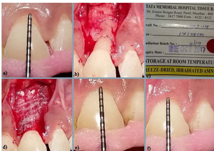
[Table/Fig-2]: a) Baseline photograph; b) Flap reflection and recipient bed preparation; c) Commercially available amnion membrane; d) Amnion membrane placement; e) Three months postoperative; f) Six months postoperative.

from the patients were taken into account.